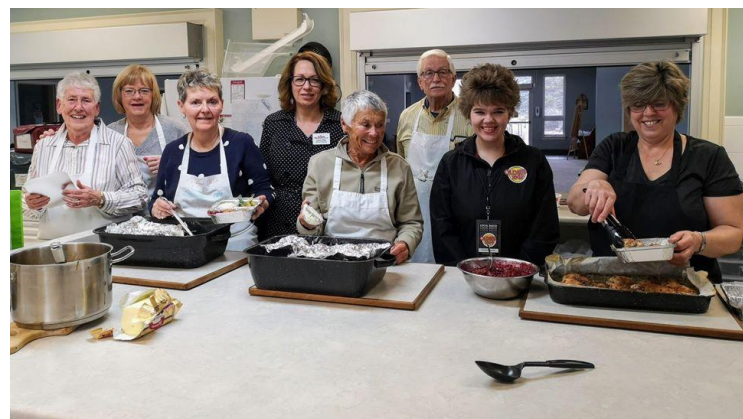
Volunteers in Brighton assist with hot meal preparation for our Meals on Wheels program.