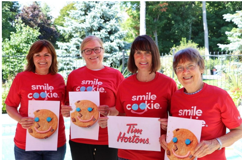
The Tim Hortons Smile Cookie campaign supporting Ed's House Northumberland Hospice Care Centre raised $42 410.17.