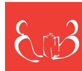
Meals on Wheels