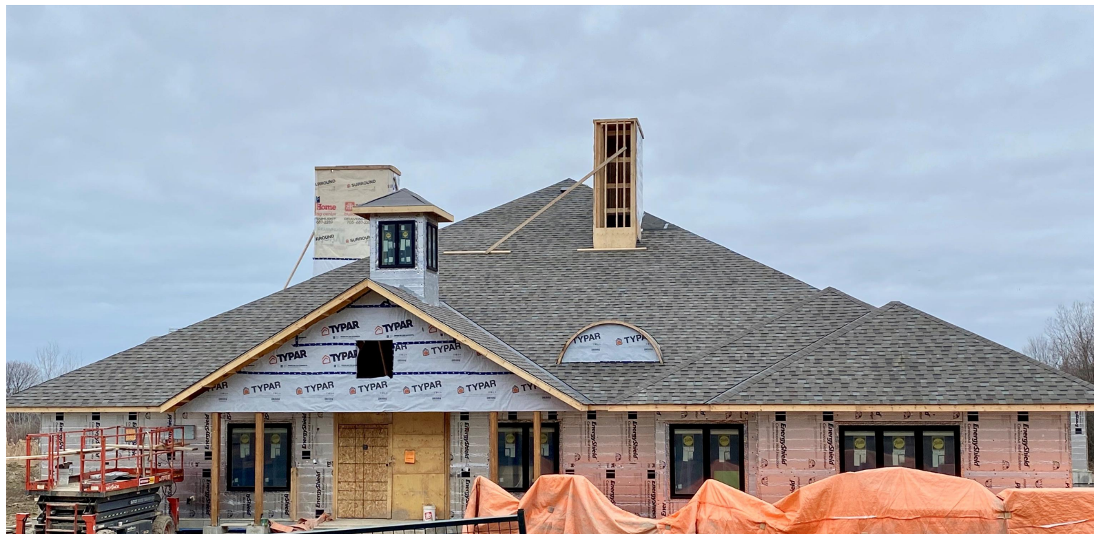
Ed's House Northumberland Hospice Care Centre, March 2020

During the 2019/20 fiscal year Dalren Ltd. made significant progress on the construction of the building, which will begin accepting residents September 2020.