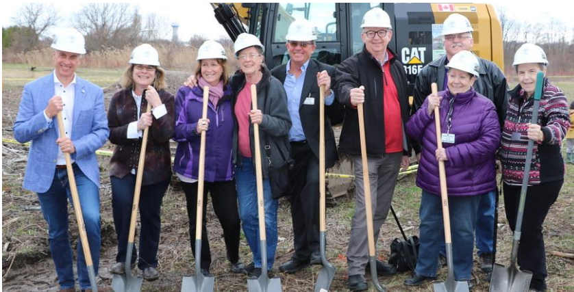
Members of the Board

Volunteers provided 85 920 hours of service to program and service delivery and 3 056 administration and committee hours.