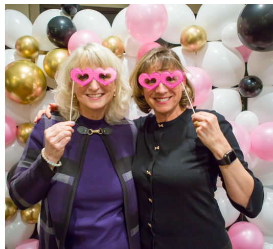
Our first annual Handbags for Hospice event raised $87 000 for Ed's House Northumberland Hospice Care Centre.