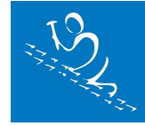
Home Help and Maintenance