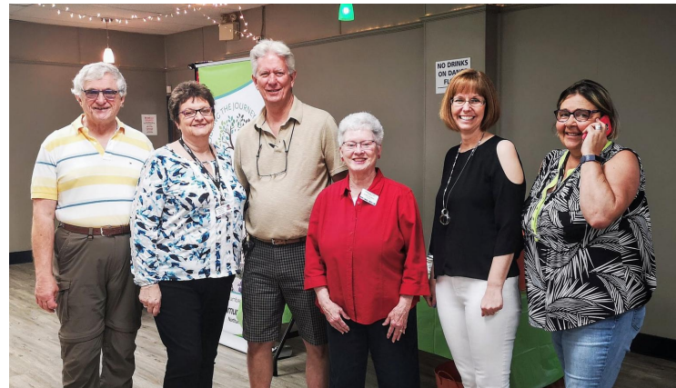
Volunteers and staff at the Port Hope Seniors Picnic