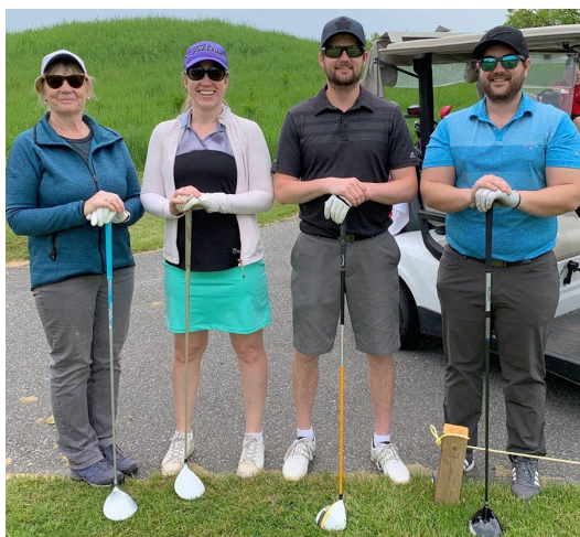
134 golfers helped us raise $22 044 for CCN programs and services.