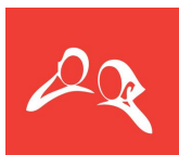
Telephone Security Checks