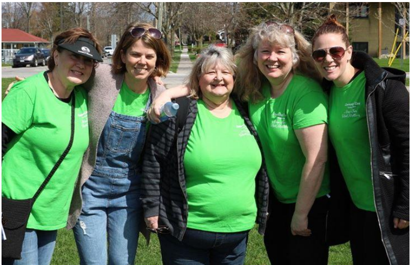
Our Hike for Hospice raised $15 754.88 in support of CCN's Hospice Services.

Community Care Northumberland hosted five signature events this year to support our programs and services and Ed's House Northumberland Hospice Care Centre: