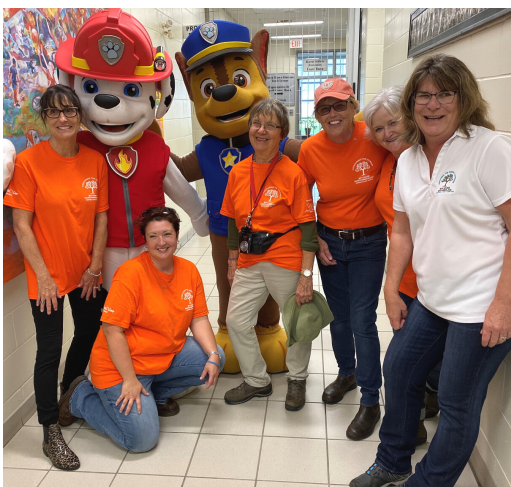
Our Touch-a-Truck event raised a total of $11 000 for Ed's House Northumberland Hospice Care Centre.