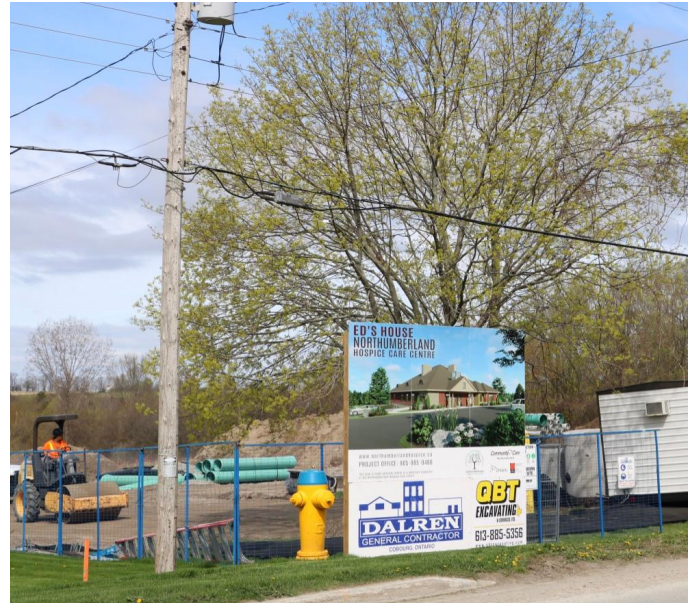
The site at 1301 Ontario Street in Hamilton Township

During the 2019/20 fiscal year Dalren Ltd. made significant progress on the construction of the building, which will begin accepting residents September 2020.